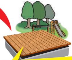
Large benches storing fire fighting and rescue equipment

By using the fire fighting and rescue equipment stored inside, you can greatly shorten fire fighting and rescue times to save others, even by yourself.