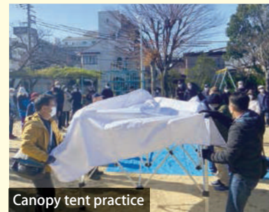
Canopy tent practice

Interview with a neighborhood association currently using a local disaster response station