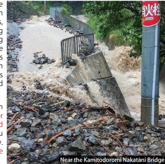
Near the Kamitoromi Nakatani Bridge

No one can tell when typhoons or heavy rain like this will hit again. They can come one after the other, especially between August and October. To protect yourself from danger, you must get ready; not sometime soon, but now. Please use the following points to prepare yourself for a typhoon as soon as possible.