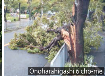
Onoharahigashi 6 cho-me