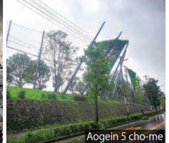
Agein 5 cho-me